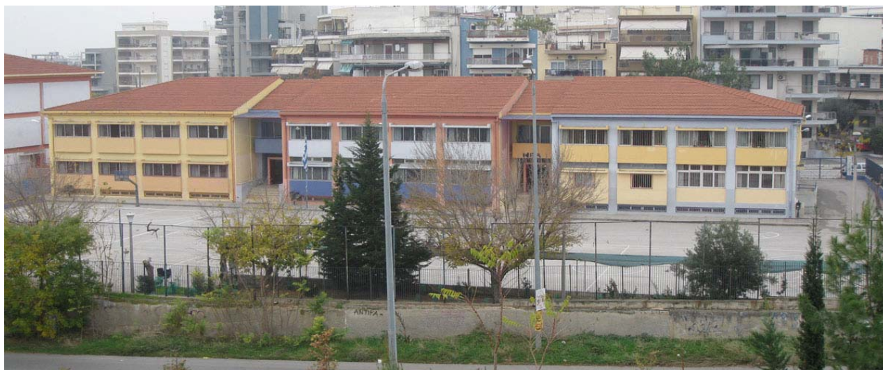
Front view of our school

Established in 1986 as a six class school, nowadays operates with 18 classes (3 in each Grade) in morning school, 2 integrated classes (students with disabilities) and 3 classes in afternoon school.